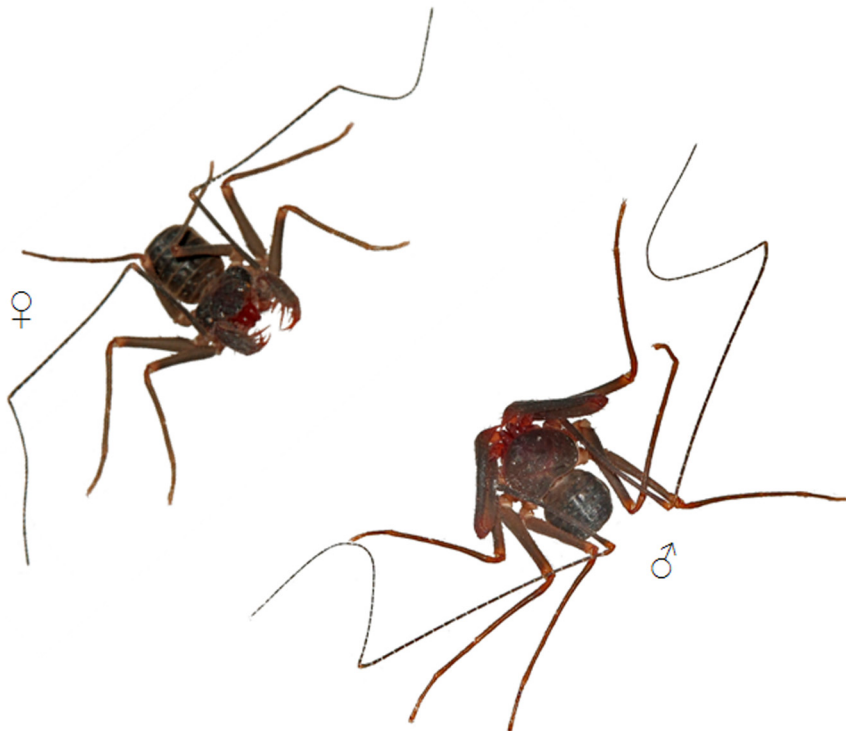
FIGURE 3. C. sillami : living male and female specimens.

Measurements (in mm). Holotype: Cephalothorax: length: 2.62, width: 3.71; Pedipalp: femur: 2.57, tibia: 2.17, basitarsus: 0.88, distitarsus: 0.48, tarsal claw: 0.39.